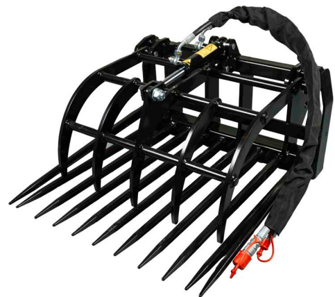
PINBUCKET WITH CLAMP